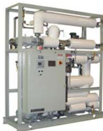
Standard and Custom Temperature Control Modules