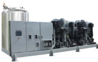
Low Temperature Process Chillers to -85°C