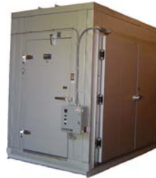
Cold Storage Room