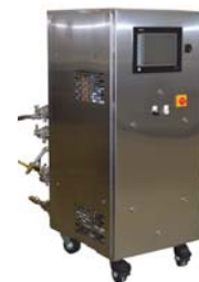
Reactor Temperature Control Systems from -85°C to +200°C